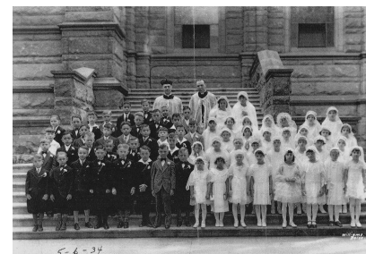
Pictured here is St. Joe's First Communion on May 6, 1934.