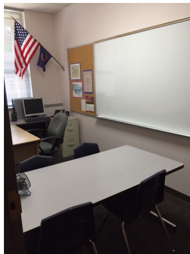
The Reading Specialists' rooms were remodeled to better serve our students.