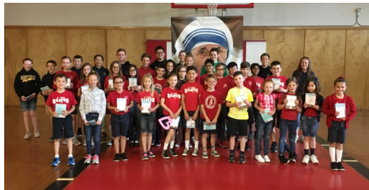
These students were recognized for modeling Saint Teresa—making our community a more Christian and loving place with their kind behavior.

to deliver St Joseph School's gift to the Missionary Sisters of Charity. Our family had a beautiful encounter in