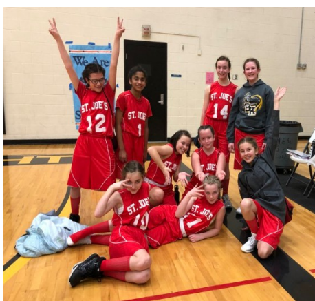
7th grade girls won the 2019 Hallsissey Sportsmanship Award!