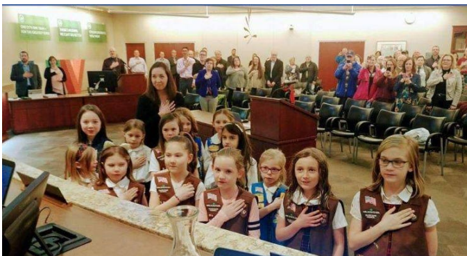
St. Joe's Girl Scout Troop 229 led the Boise City Council in the Pledge of Allegiance on March 12, the anniversary of the first Girl Scout meeting 107 years ago.